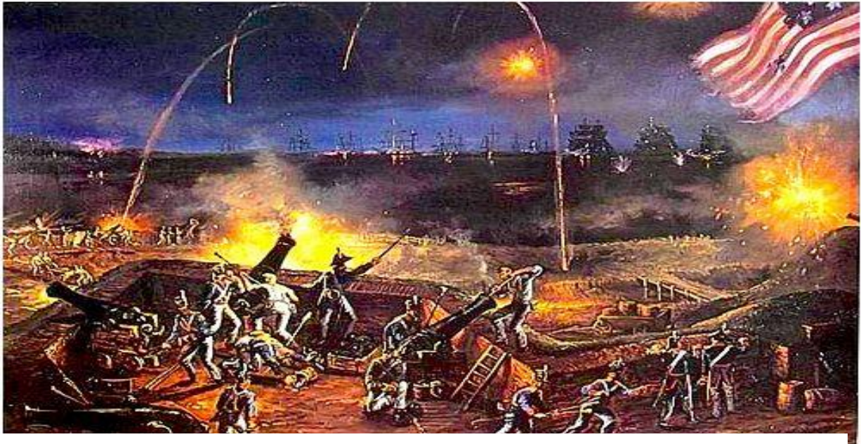
War of 1812 – Battle of Fort M'Henry – Baltimore, Maryland, USA was the inspiration for Francis Scott Key to write our National Anthem The Star Spangled Banner.