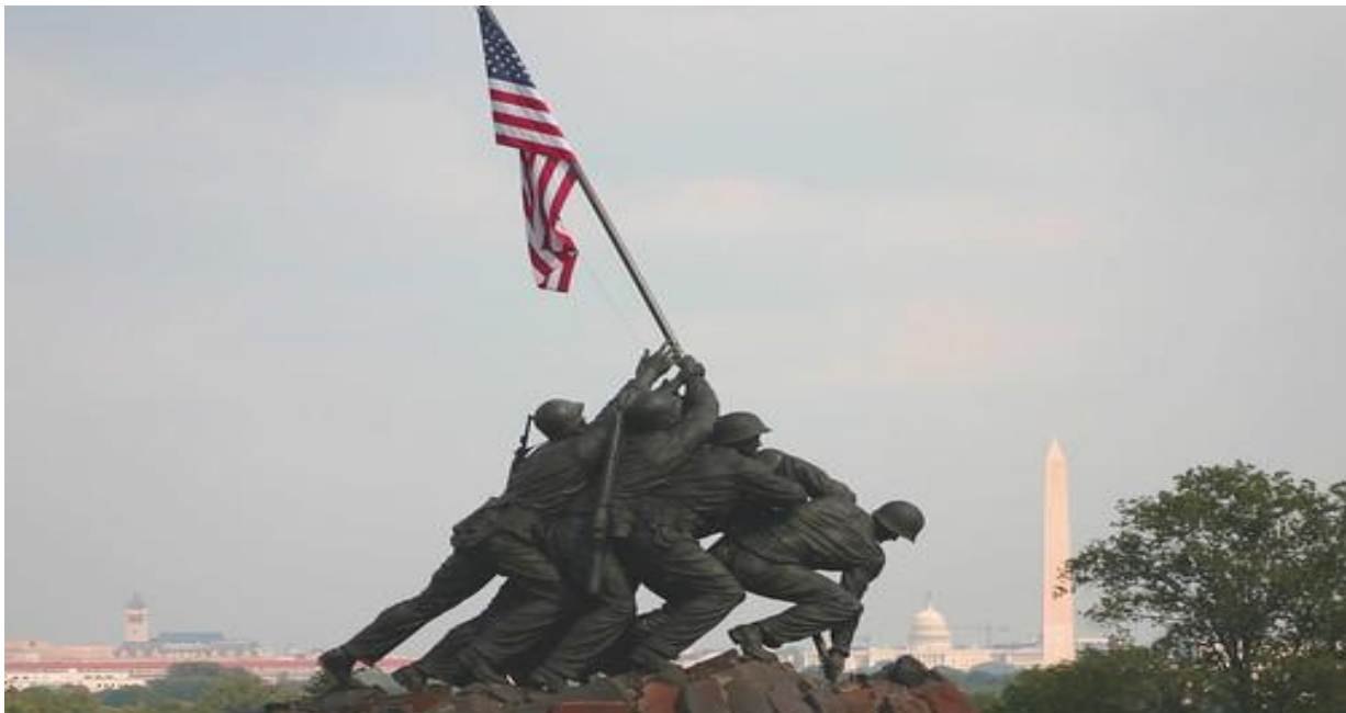
World War II 1945 - Marine Corps Memorial - Iwo Jima Flag Raisers Reminds us of the U.S. Military's sacrifice to keep our nation free.